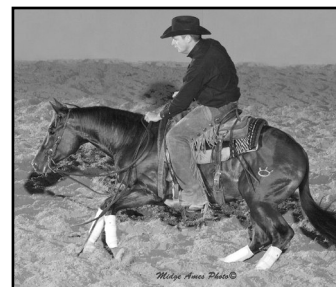
Non Pro Futurity Gelding Stakes Will You Play Chad Bushaw / Crown Ranch LP